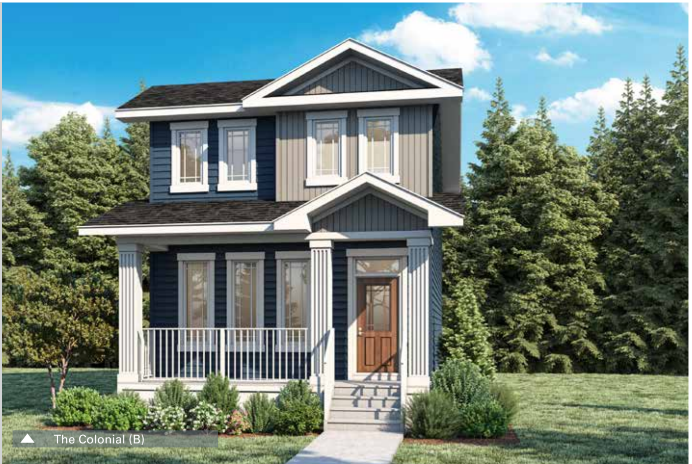
▲ The Colonial (B)