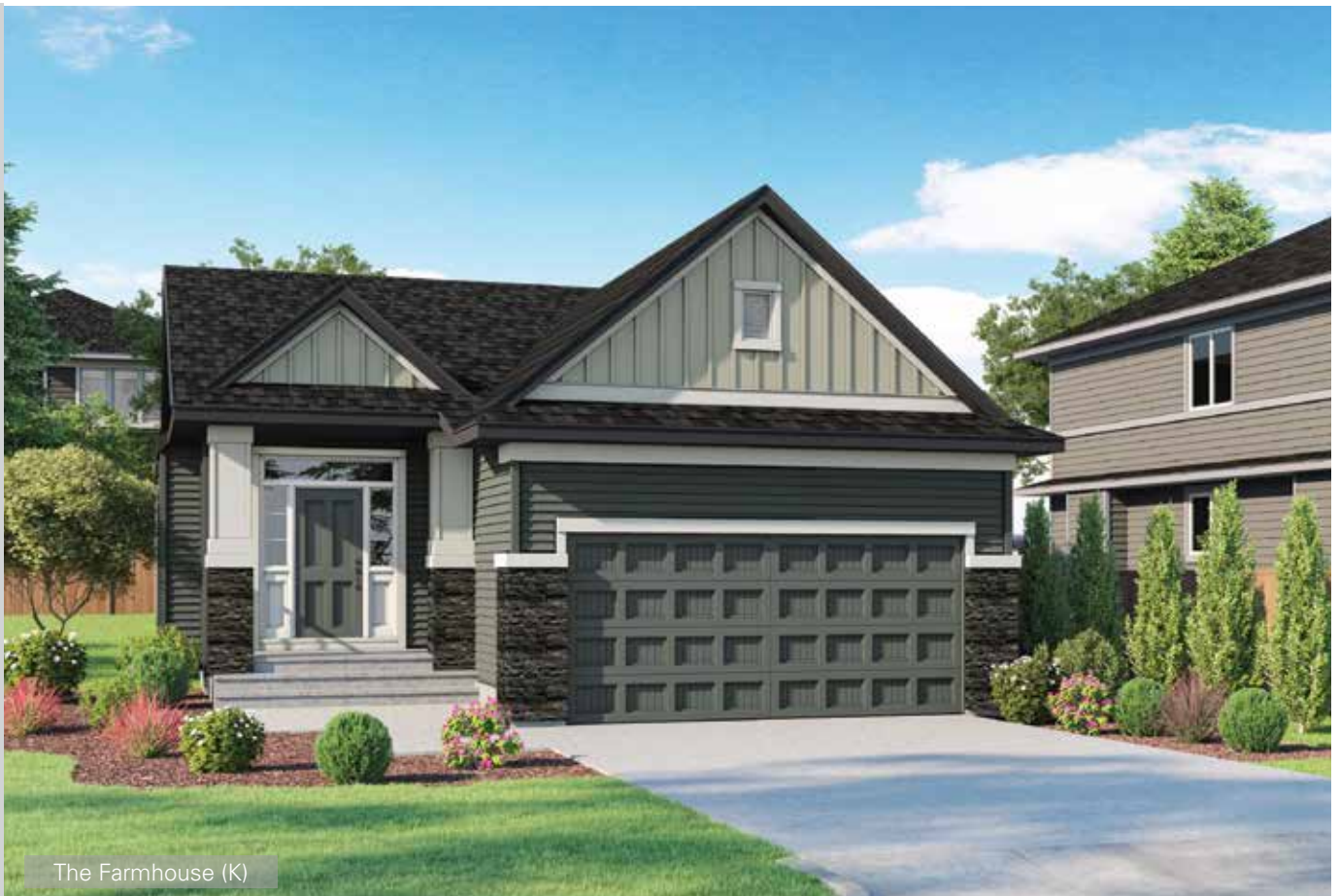
The Farmhouse (K)