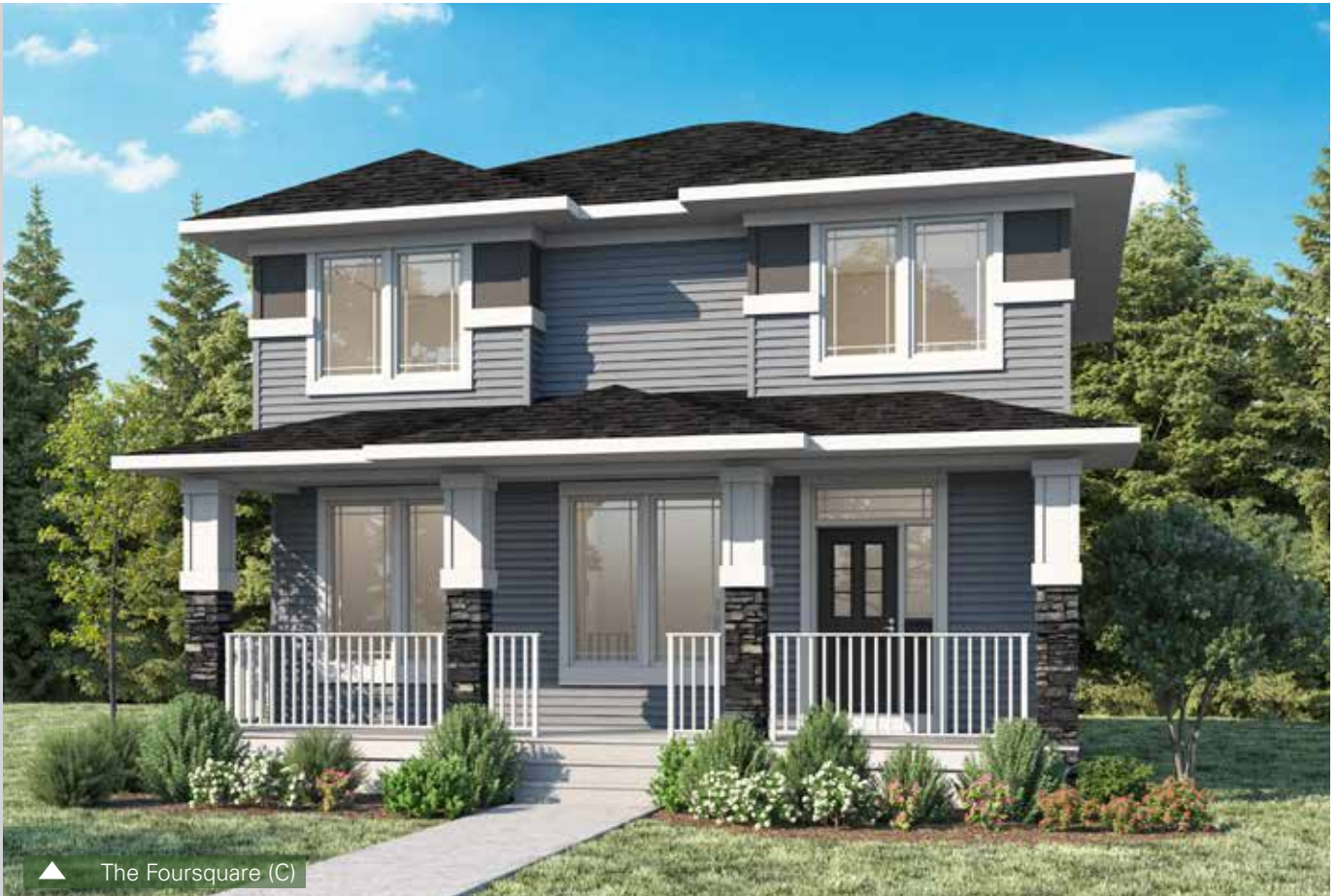
▲ The Foursquare (C)