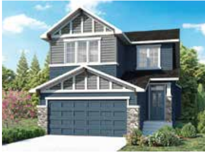
▲ The Craftsman (A)