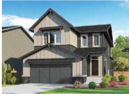
▲ The Farmhouse (K)