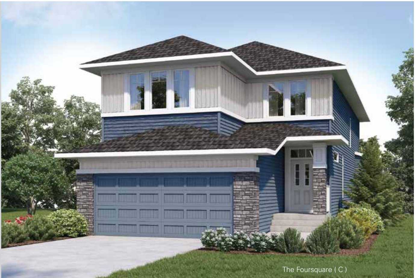
The Foursquare ( C )