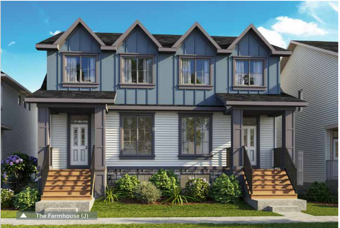
▲ The Farmhouse (J)