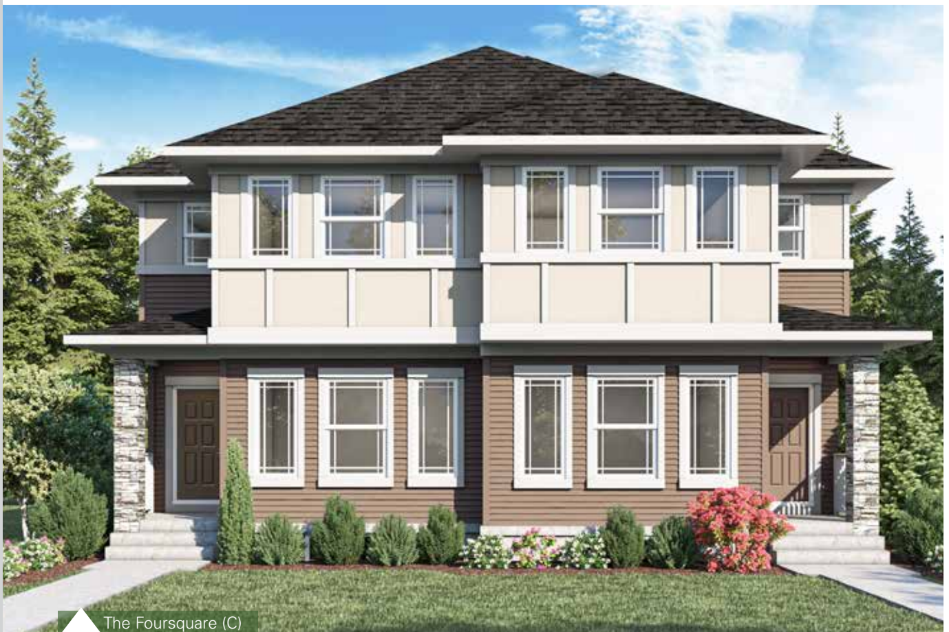
The Foursquare (C)