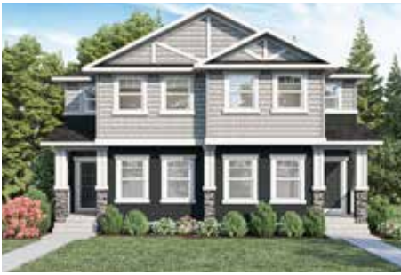
▲ The Craftsman (A)