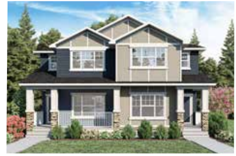
▲ The Contemporary Craftsman (F)