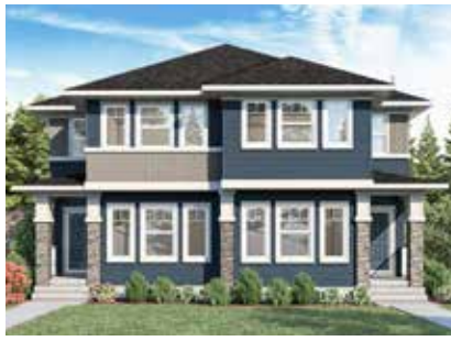
▲ The Foursquare (C)