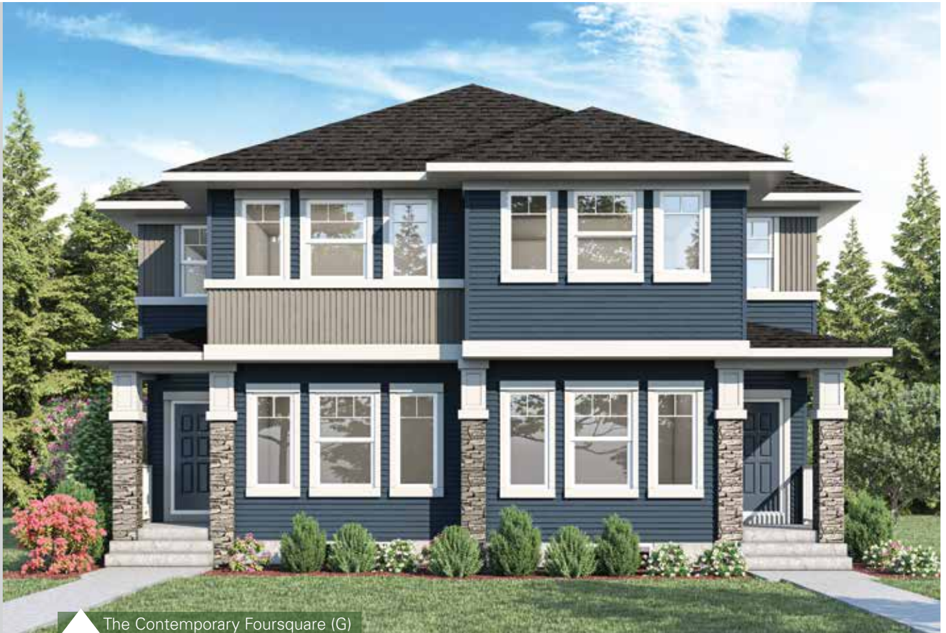
The Contemporary Foursquare (G)