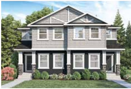
▲ The Craftsman (A)