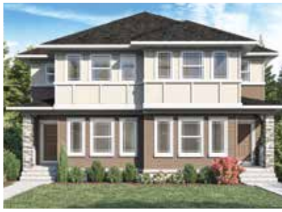
▲ The Foursquare (C)