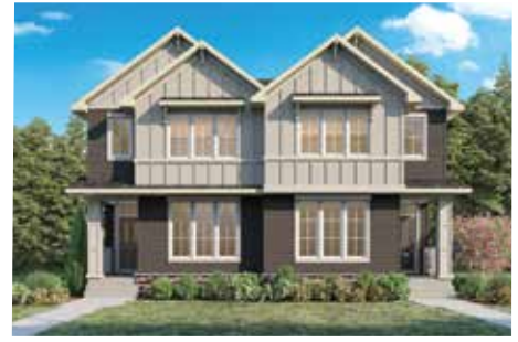
▲ The Farmhouse (J)