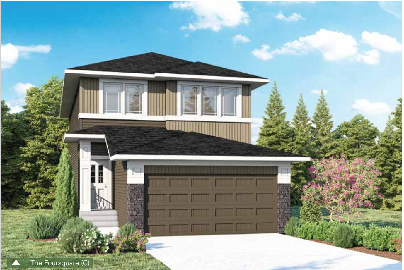
▲ The Foursquare (C)