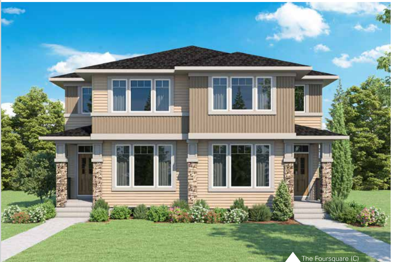
▲ The Foursquare (C)