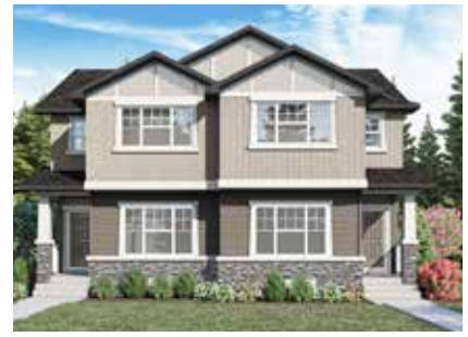
▲ The Contemporary Craftsman (F)