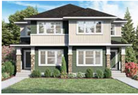
▲ The Foursquare (C)