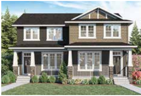
▲ The Craftsman (A)