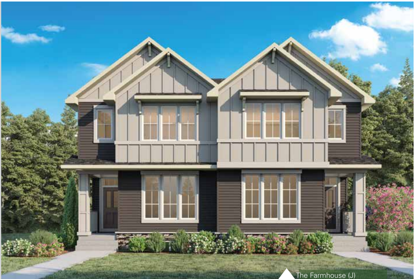
▲ The Farmhouse