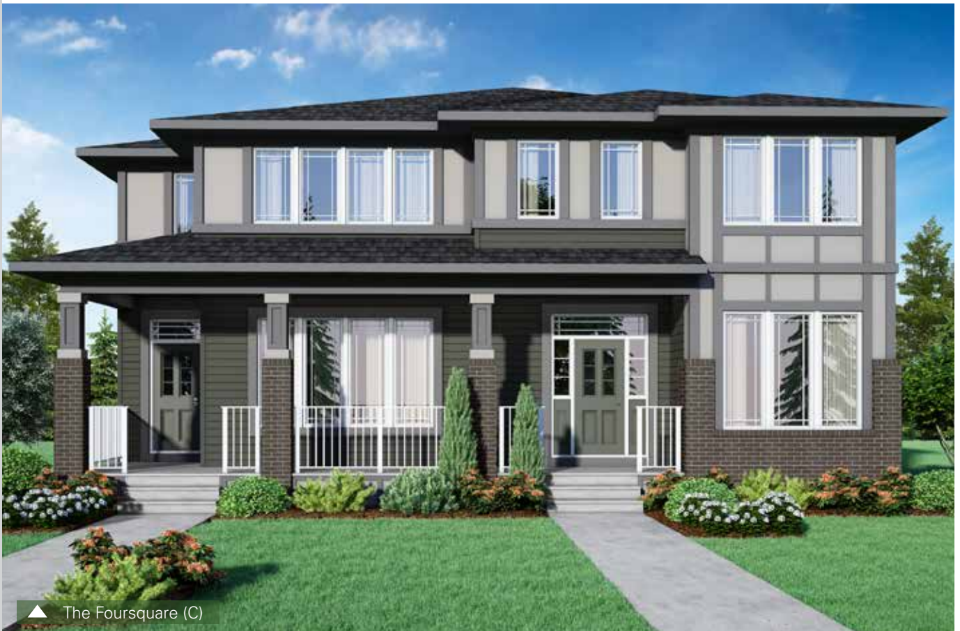
▲ The Foursquare (C)