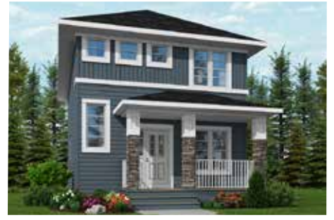
▲ The Contemporary Foursquare (G)