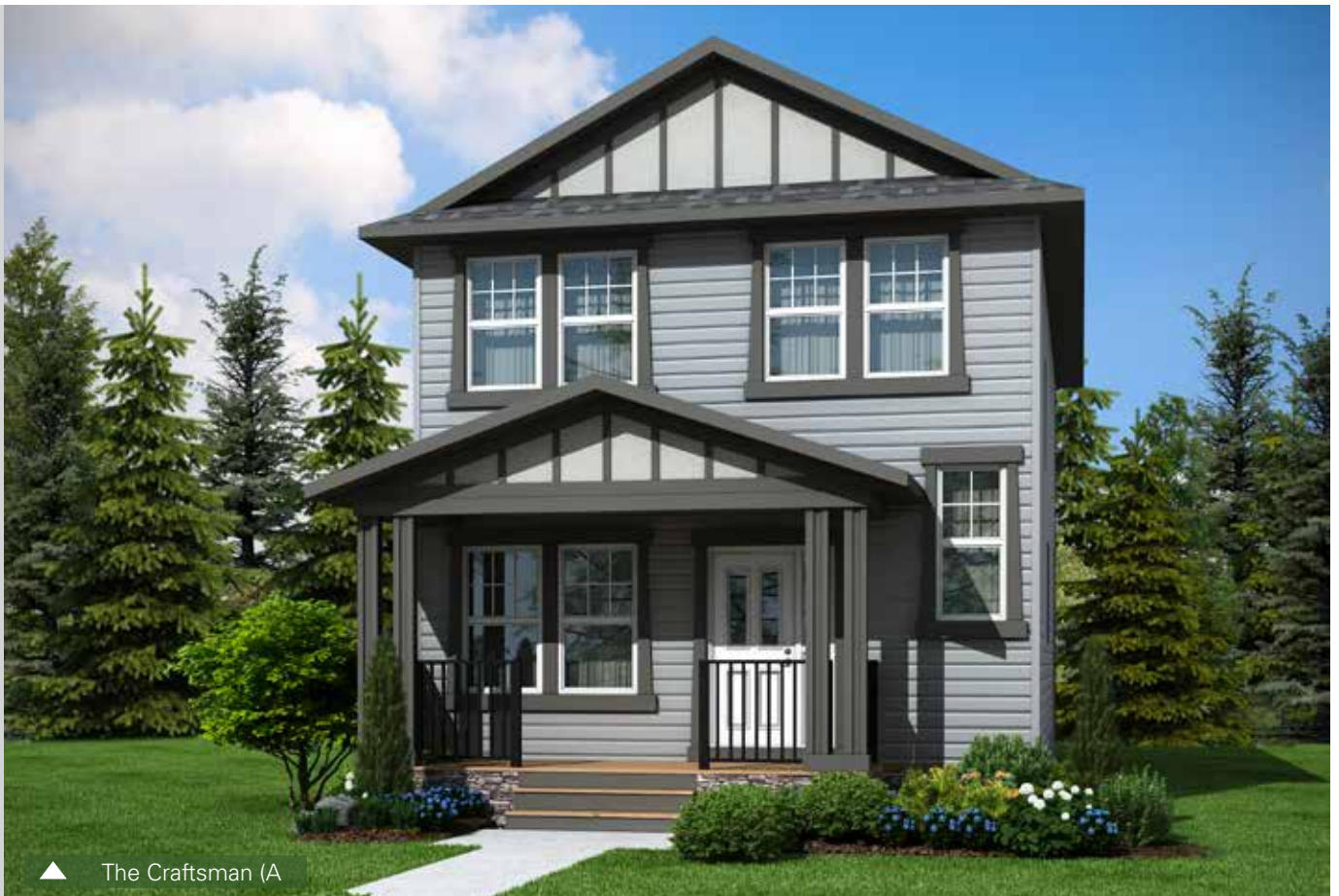
▲ The Craftsman (A)