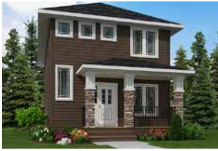
▲ The Foursquare (C)