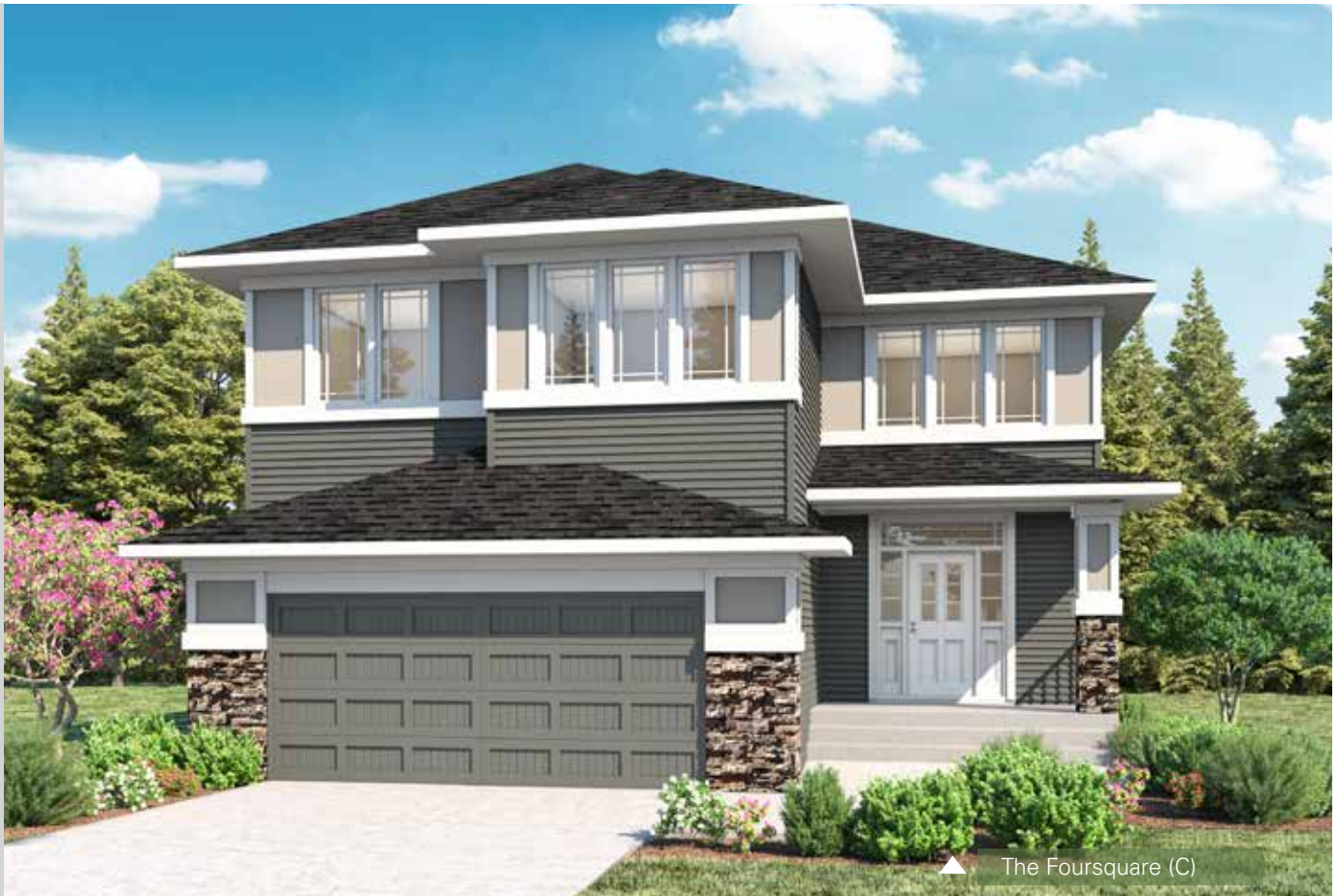
▲ The Foursquare (C)