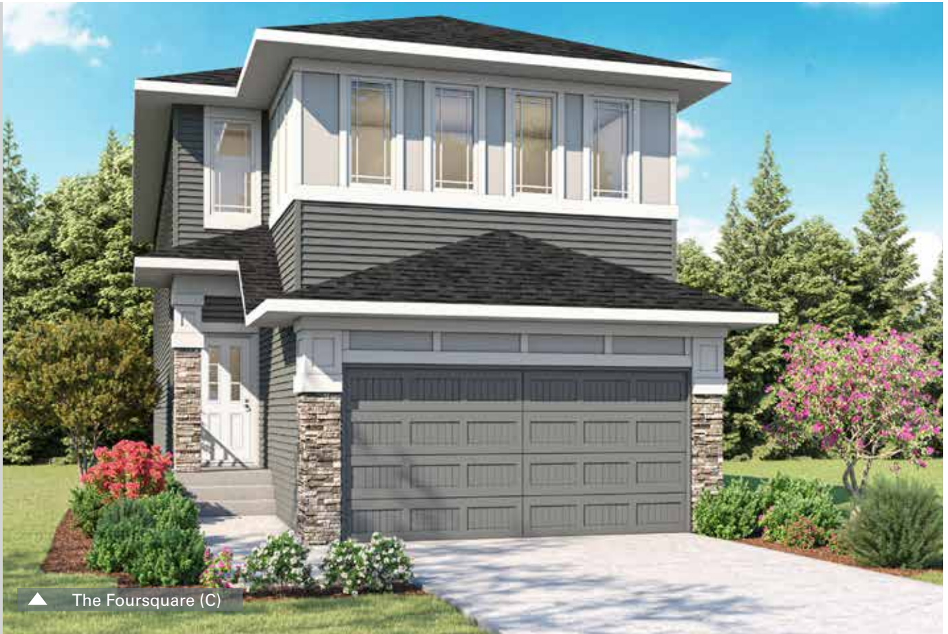
▲ The Foursquare (C)