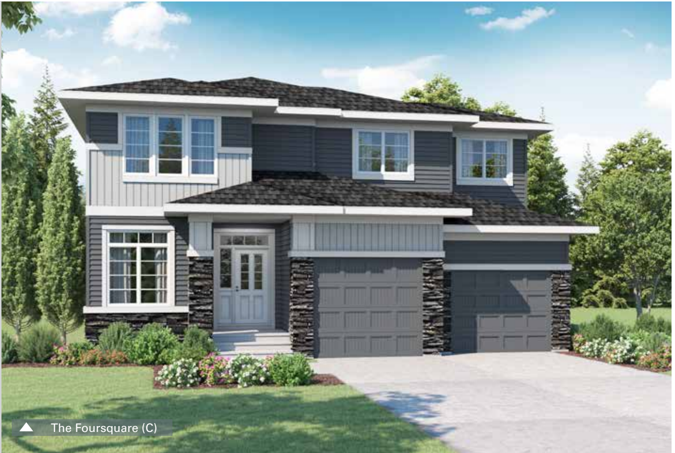
▲ The Foursquare (C)