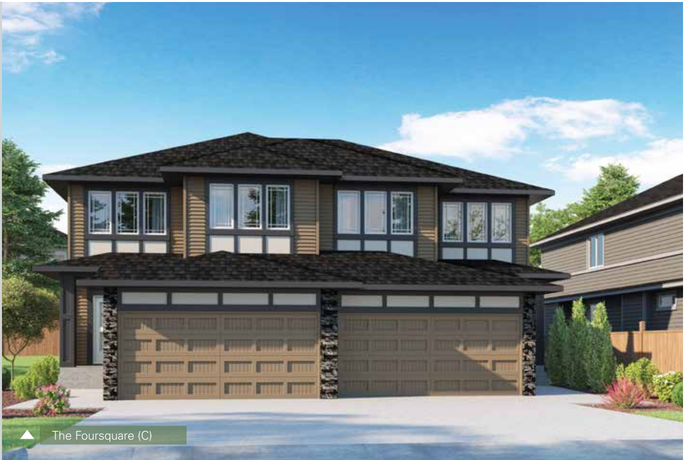
▲ The Foursquare (C)