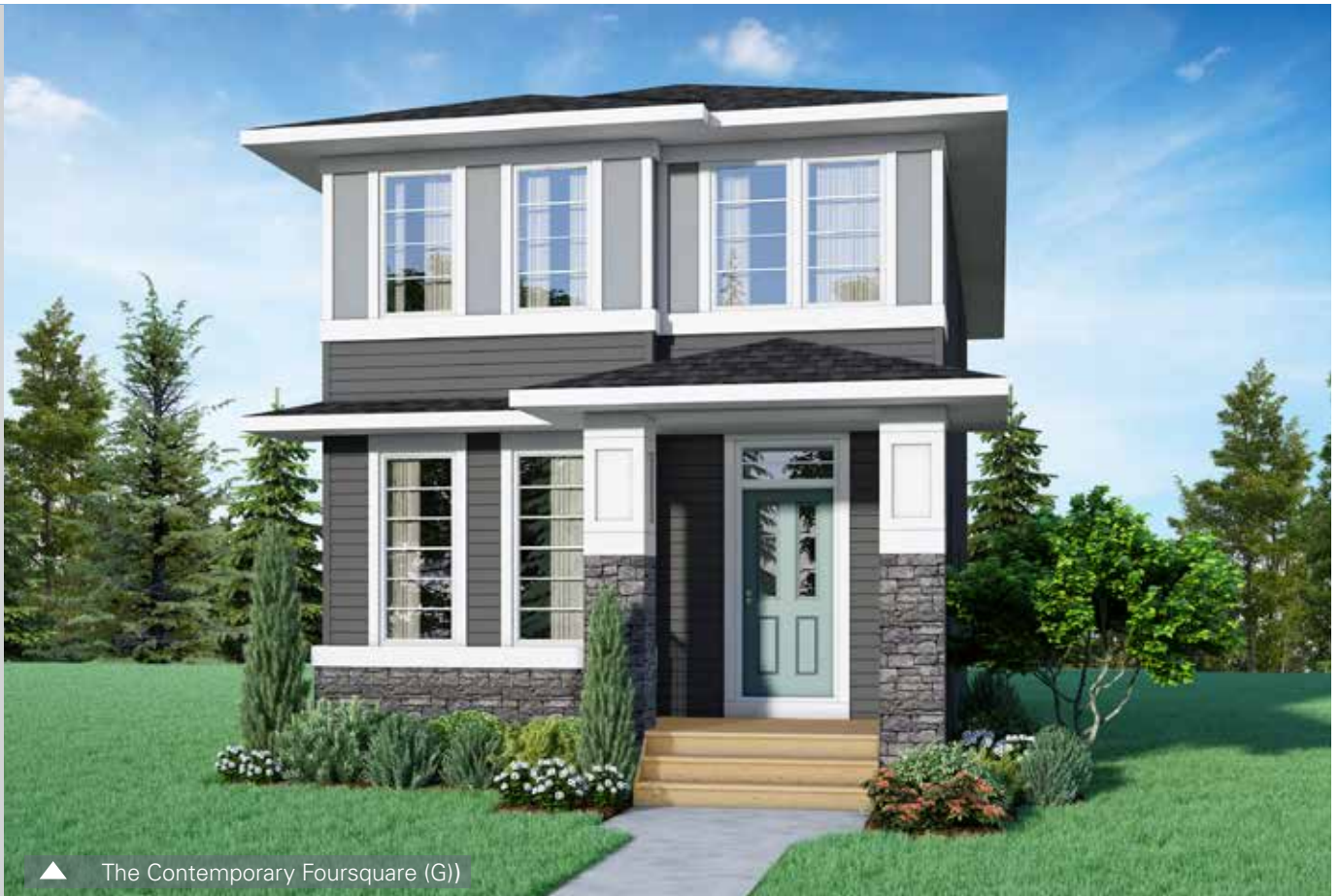
▲ The Contemporary Foursquare (G)