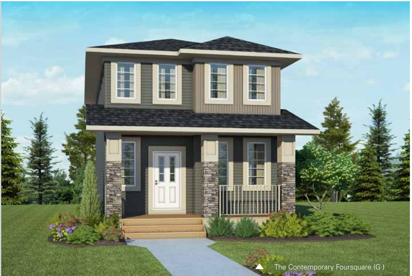
▲ The Contemporary Foursquare (G )