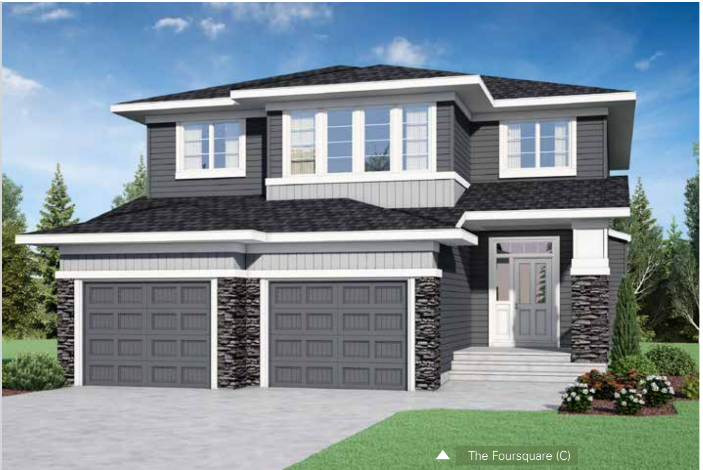
▲ The Foursquare (C)