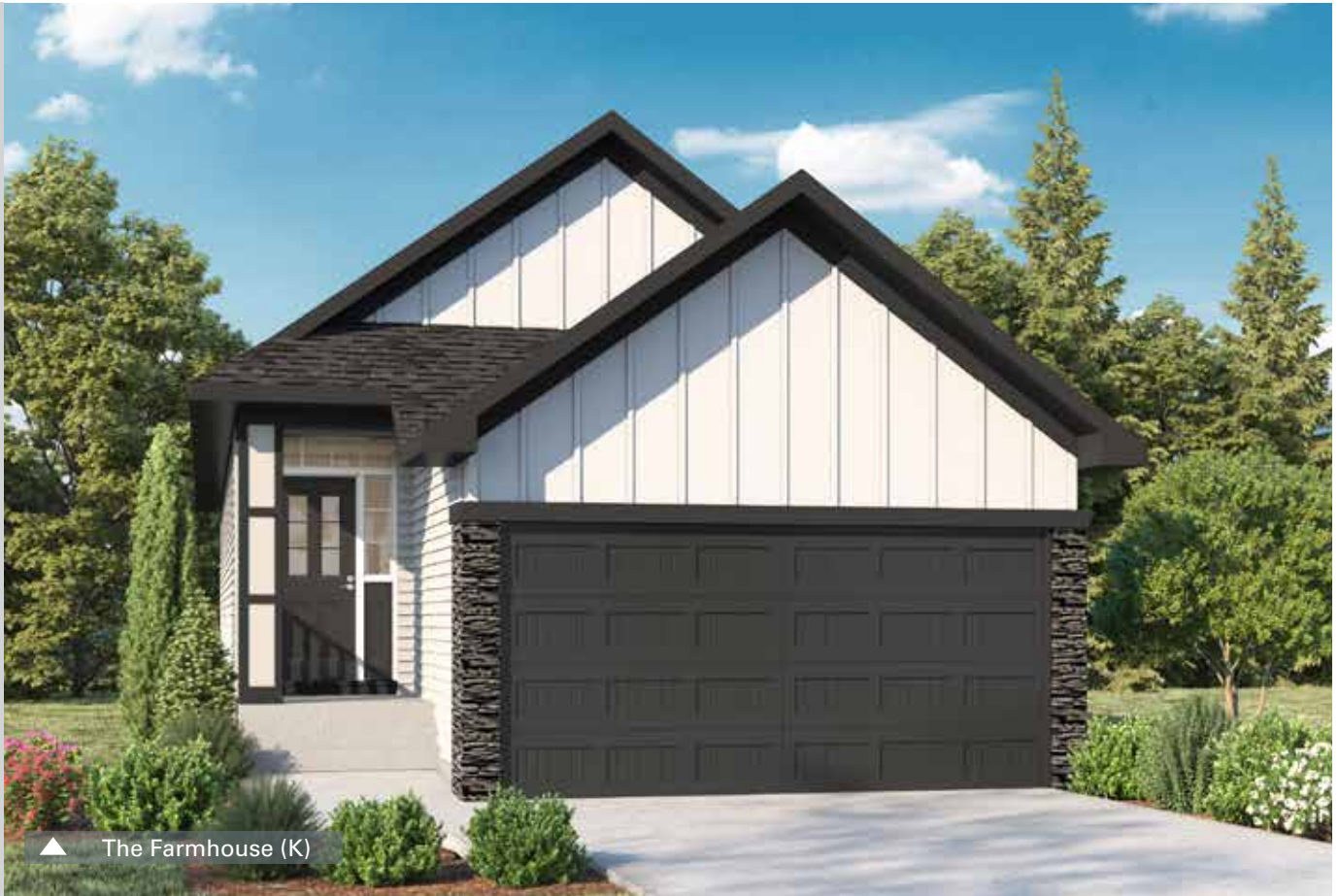
▲ The Farmhouse (K)