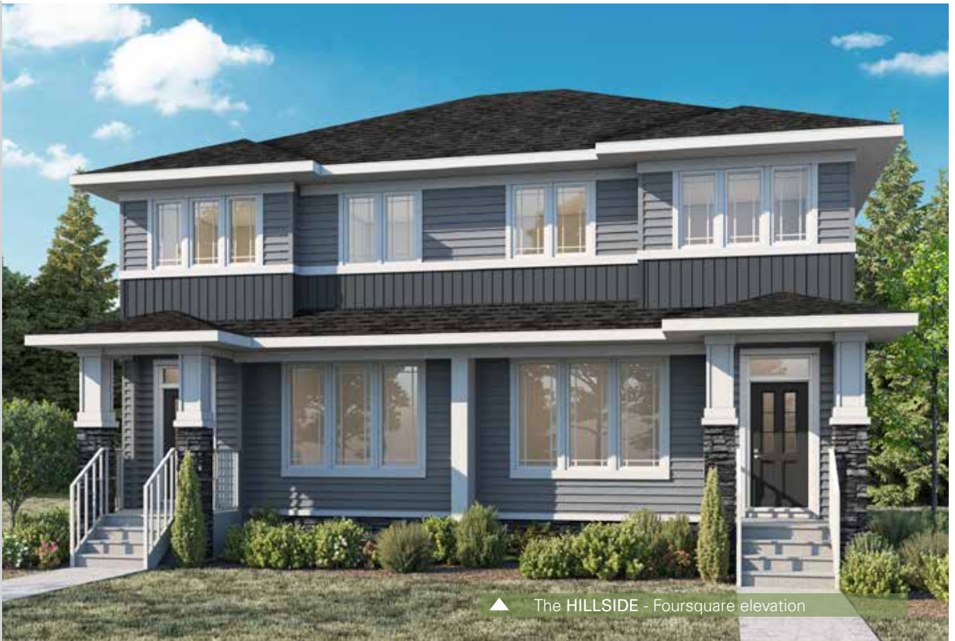
▲ The HILLSIDE - Foursquare elevation