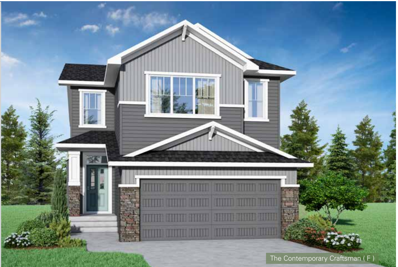
The Contemporary Craftsman ( F )