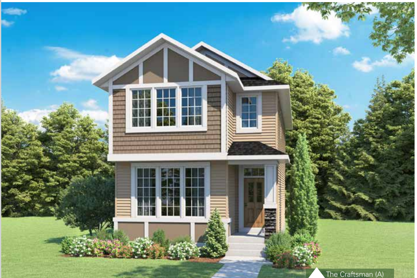
The Craftsman (A)