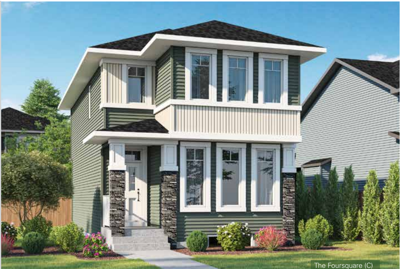
The Foursquare (C)