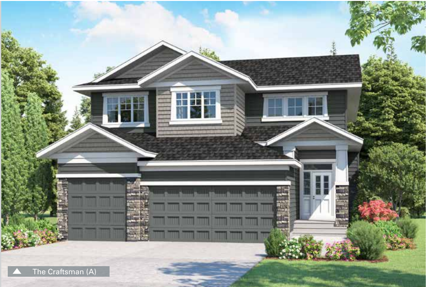
▲ The Craftsman (A)

MODEL 47 - 22 www.nuvistahomes.com Total: 2544 sq. ft.