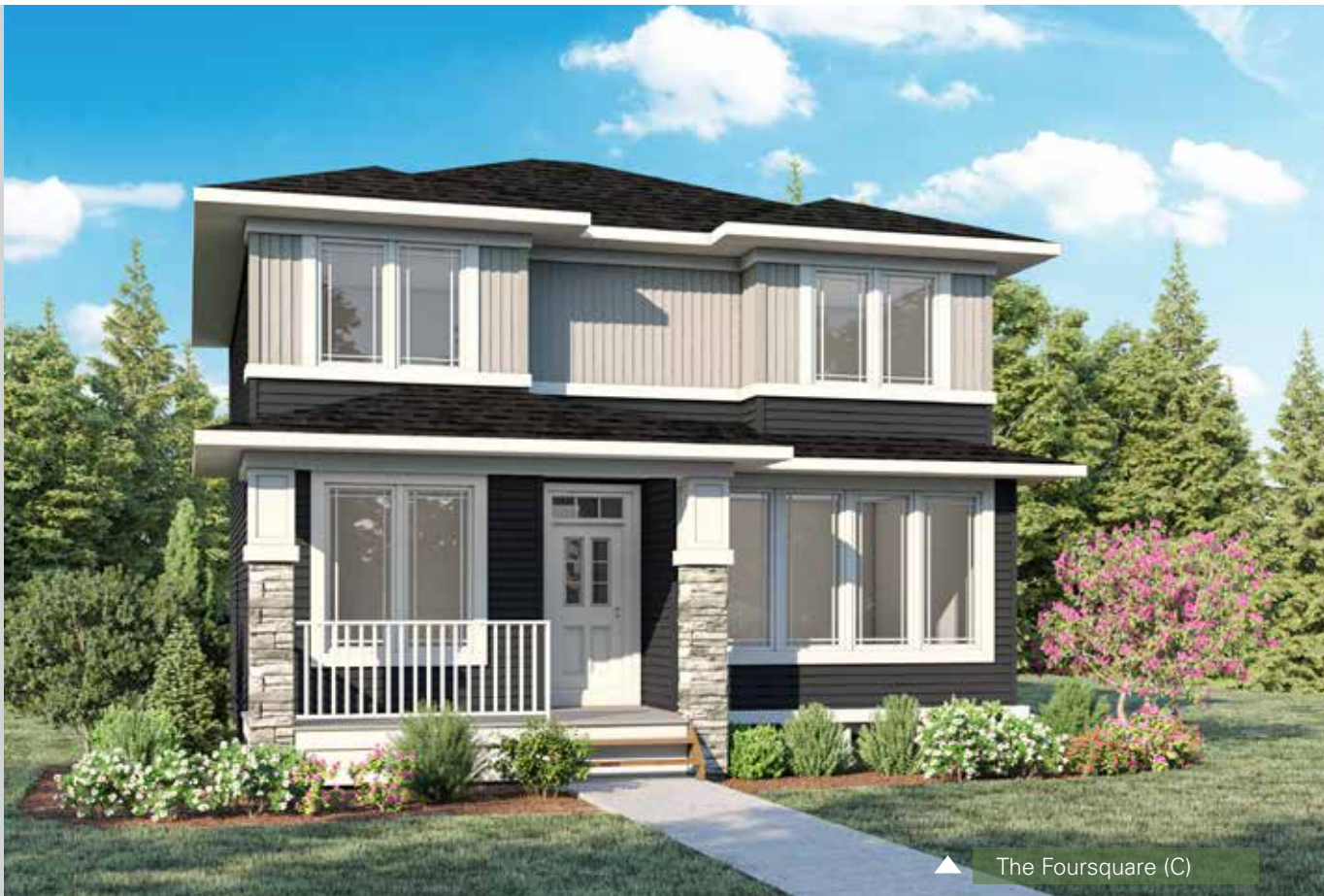
▲ The Foursquare (C)