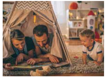
▲ The Farmhouse (J)