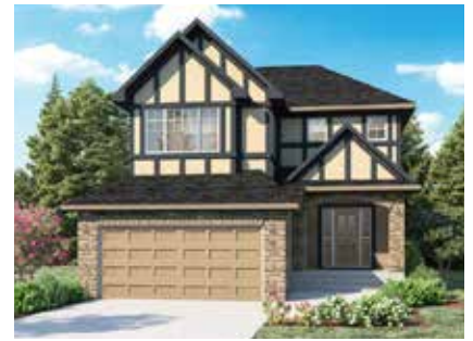
▲ The Tudor (E)