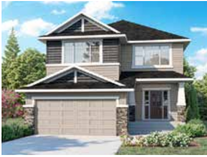
▲ The Craftsman (A)