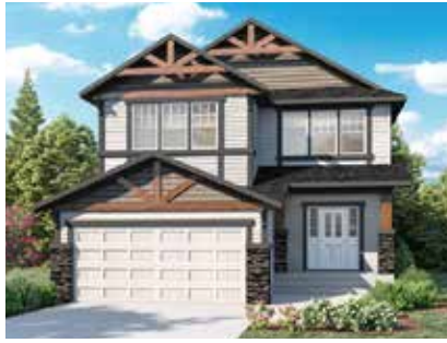
▲ The Alpine (D)