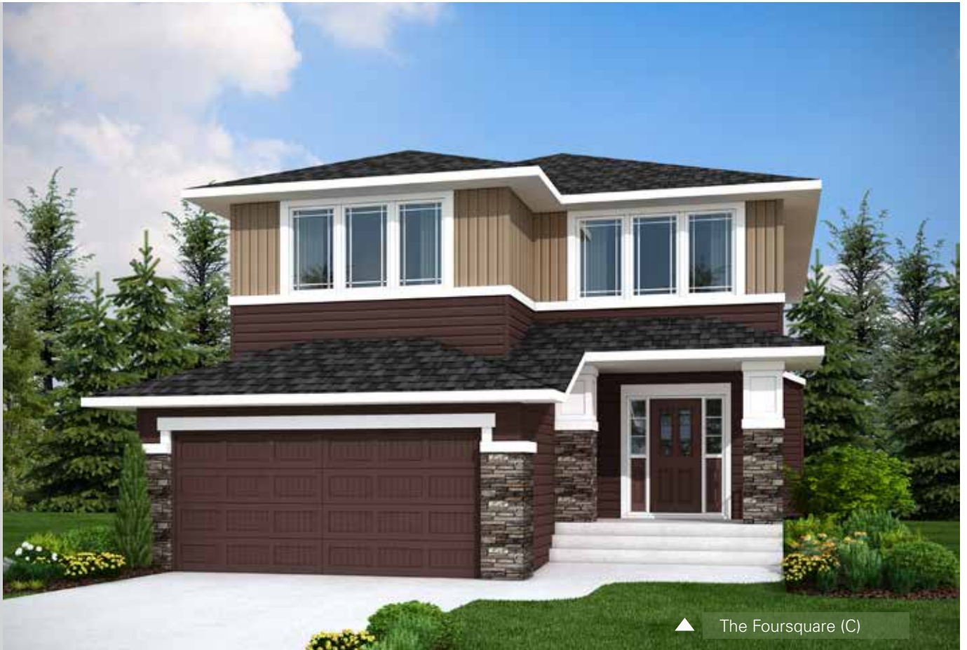
▲ The Foursquare (C)