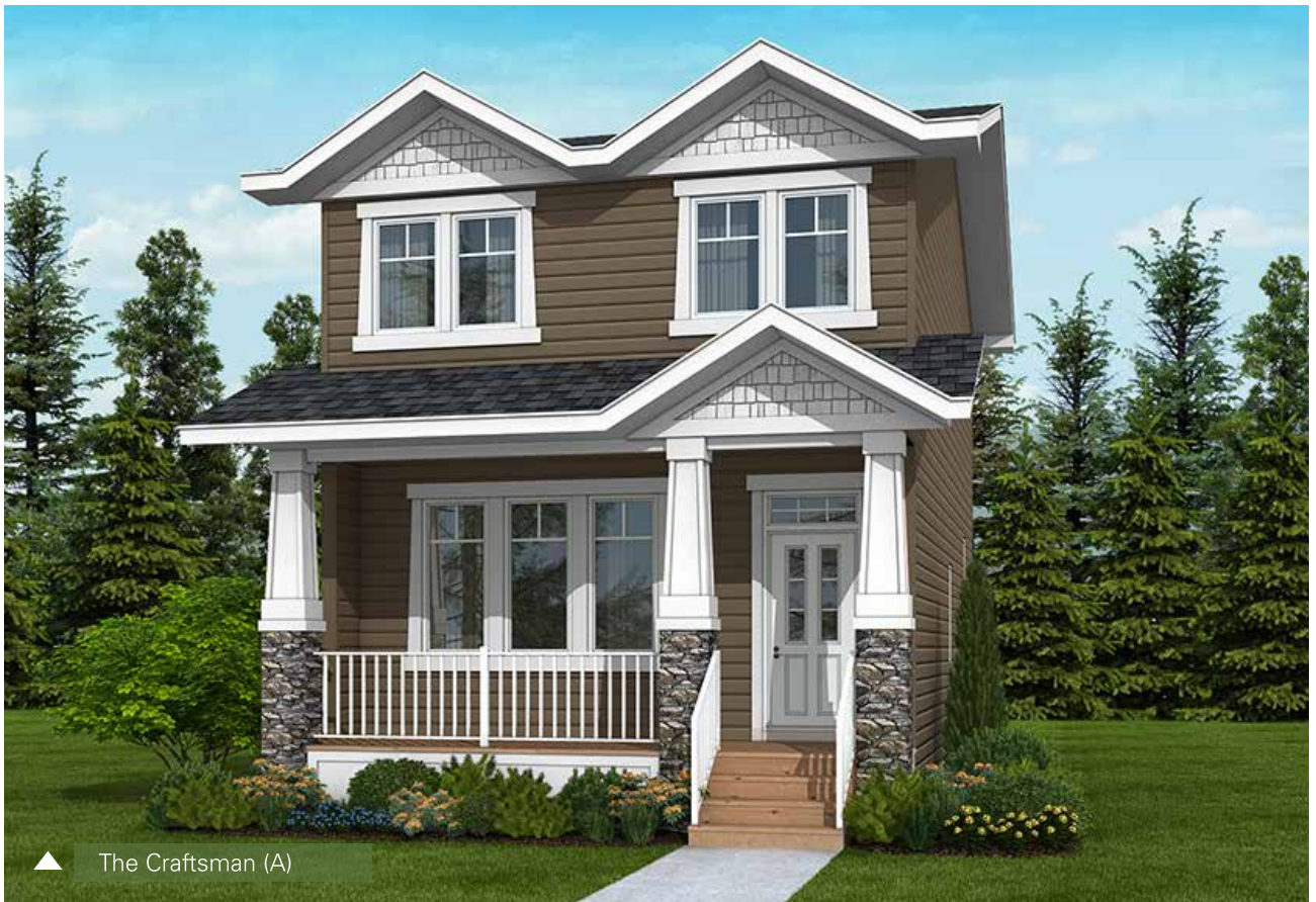
▲ The Craftsman (A)